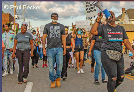
Policing, policy & public health