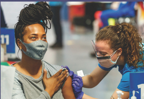
COVID and our communities